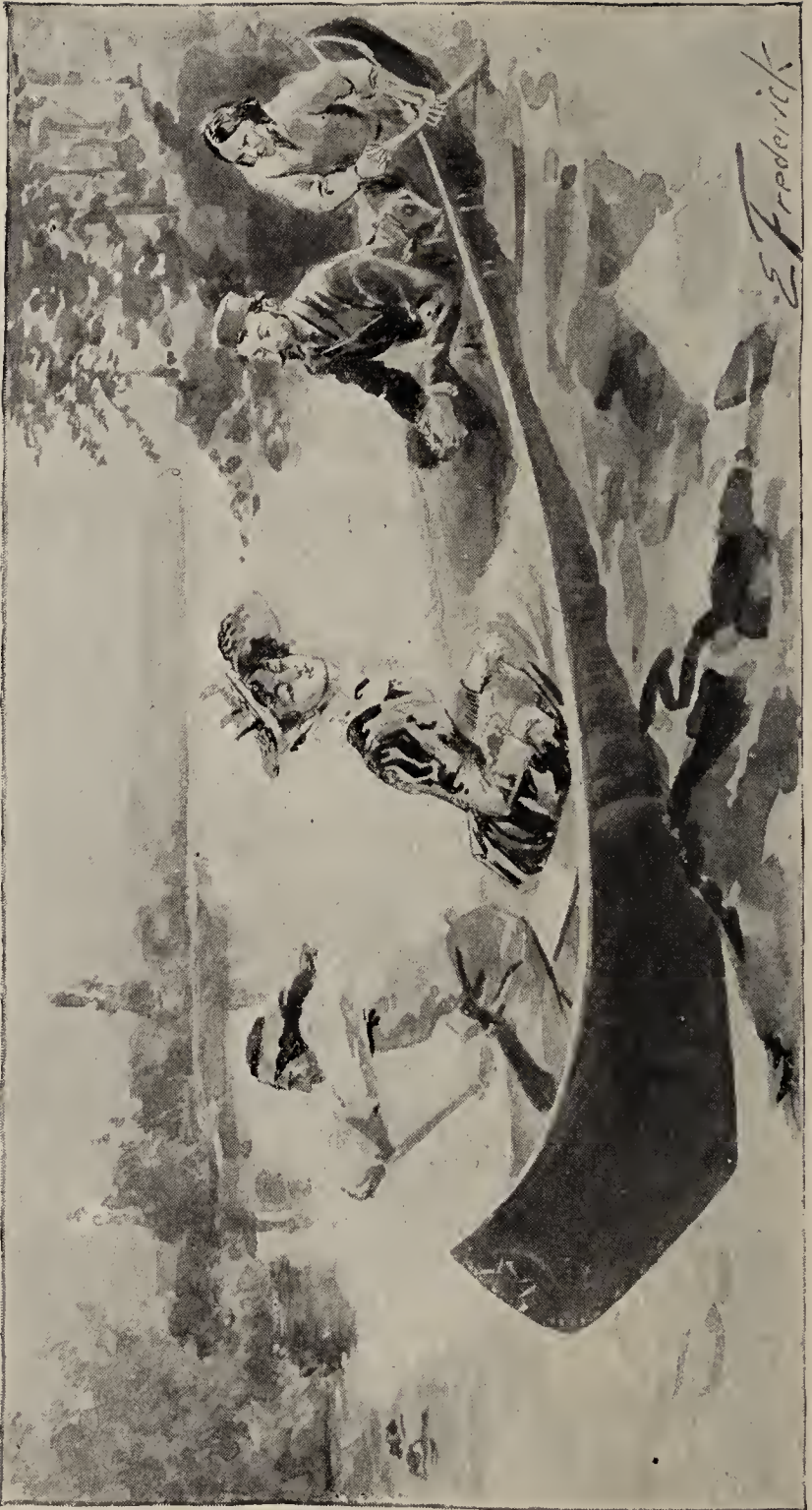
"THE SILENCE WAS BROKEN ONLY BY THE REGULAR DIP OF THE PADDLE."—Page 47.